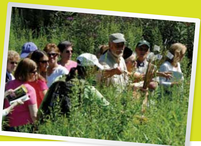
Wildflower hike at Stonebridge Waterfowl preserve.

The Aspetuck Land Trust offers numerous educational and specialty hikes for children and adults that are open to everyone and offer a great way to explore and learn more about the diversity of our 42 trailed nature preserves on over 1,700 acres of open space in our community. Reserve your space early as spaces are limited for these popular hikes. More details on our website.