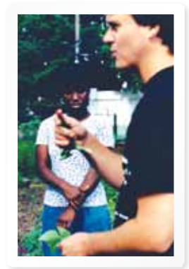
Teaching urban youth about farming in Minneapolis.