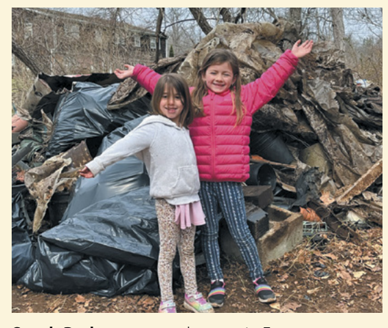
South Park property clean up in Easton.