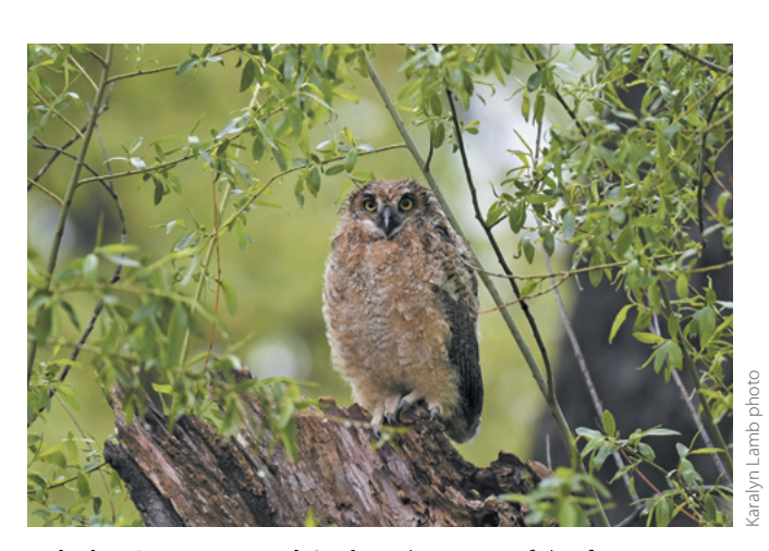
A baby Great Horned Owl peeking out of the forest.