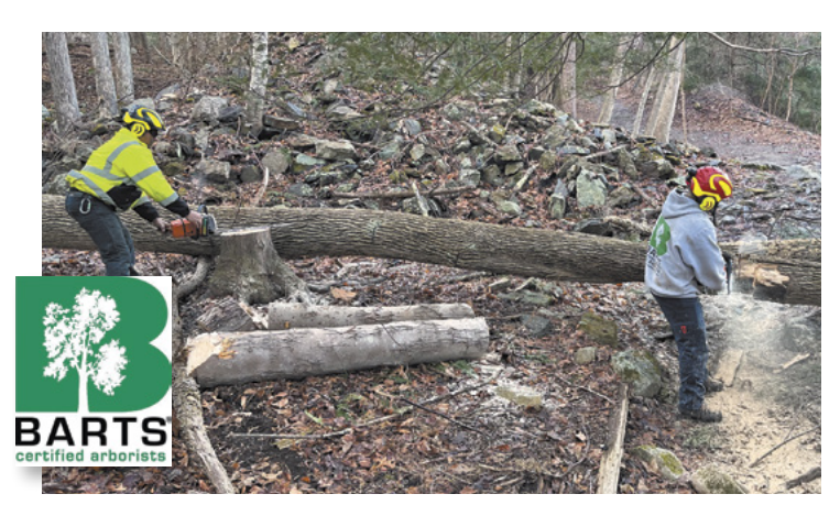
Bart's Tree Service volunteered a day and dropped 60 dead ash trees in Trout Brook Valley. The ashes are being killed by the invasive Emerald Ash Borer. Thanks Bart's!