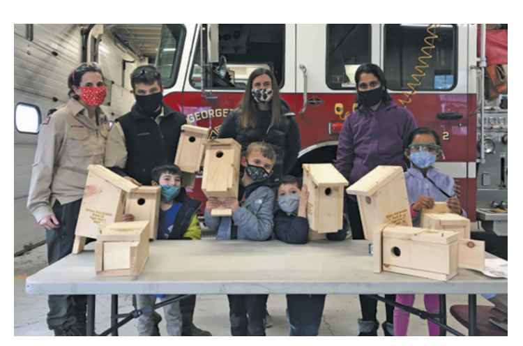
Wilton Pack 22 Tiger Den made these beautiful bluebird boxes for use in Aspetuck Land Trust preserves. Thanks Tigers!