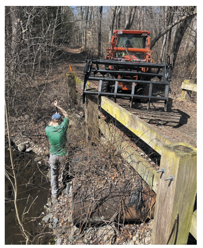
ALT staff repairing the bridge at the Hawley's Brook fish ladder in Trout Brook Valley.

More than 140 Trail Stewards volunteer their time to help monitor and maintain ALT's 45 trailed nature preserves.