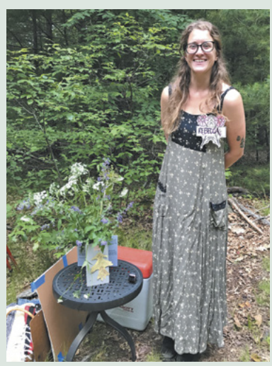
An inspiring art event at the Leonard Schine Preserve in Westport.