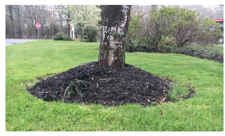
Volcano mulching starves roots of oxygen and weakens trees

Mulches do suppress weed growth. They suppress good growth too. They smother roots and lock up nitrogen. The volcano-shaped piles at the base of trees cause girdling roots, lack of oxygen, and lead to long term decline. The way nature mulches is with plants. No spaces in nature are ever bare. Plants are social, they want to be together. If you can't buy enough plants to fill a space properly, why not start with a smaller space or mix in a fast-growing ground cover, or toss in some seed of a low-growing annual to hold the space until the permanent plants fill in? It is fine to use your home-made compost as mulch, to cover any remaining bare soil.