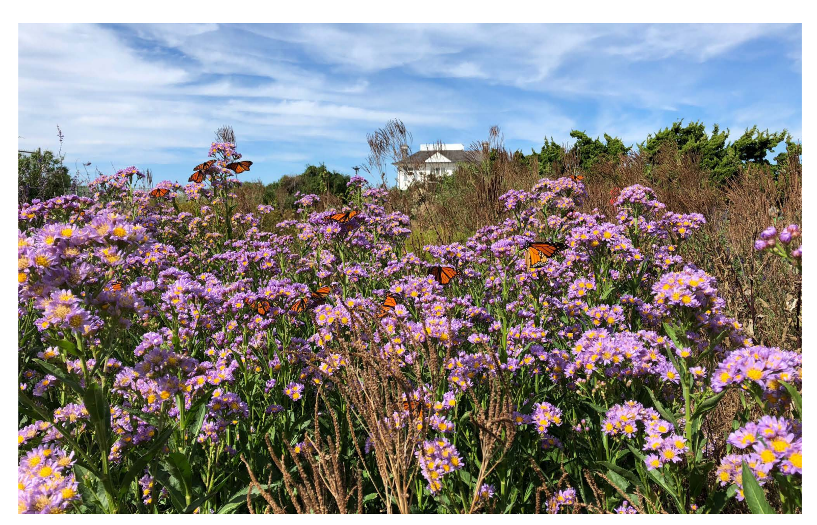
Design and photo by Abby Lawless, Farm Design