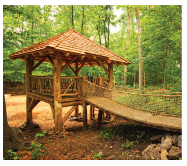
The playhouse for children at Southport Park opened in 2013.