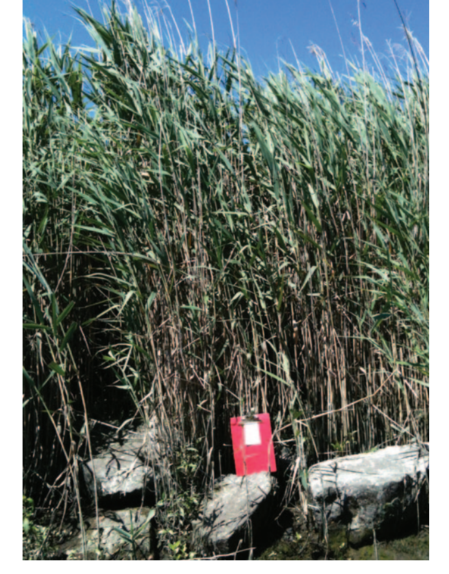
Invasive Phragmites have taken over the salt marsh. They grow over 15 feet tall, impeding views of the river and crowding out native plants and wildlife.